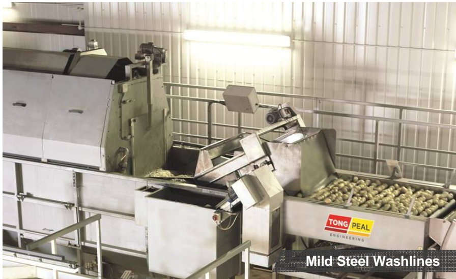
Mild Steel Washlines