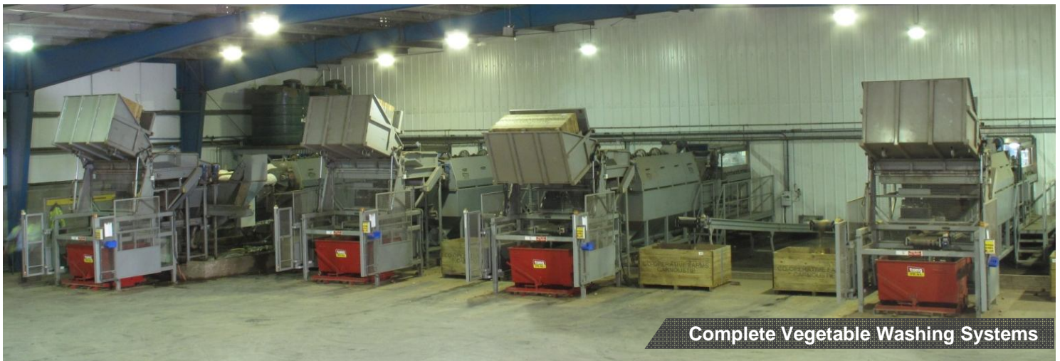
Complete Vegetable Washing Systems