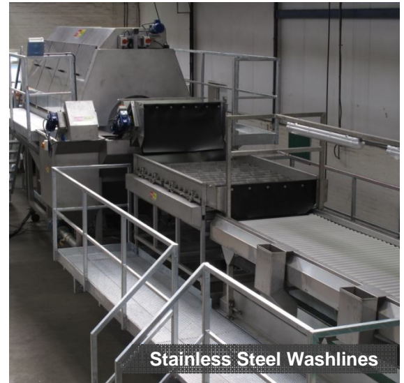
Stainless Steel Washlines