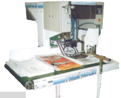
Typical Dimensions Shown, Equipment Manufactured To Suit Each Installation.

Case Size (mm); 1,900 x 1,000 x 2,200 high. Gross Weight; 320 Kg.