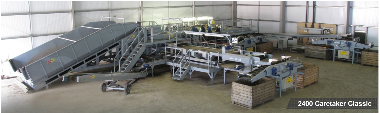
2400 Caretaker Classic