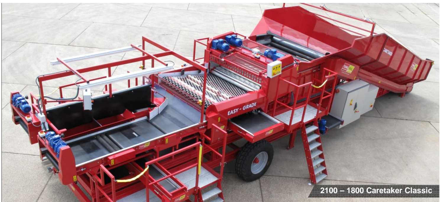
2100 – 1800 Caretaker Classic