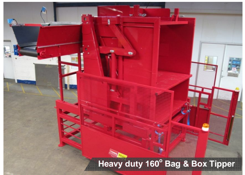
Heavy duty 160° Bag & Box Tipper