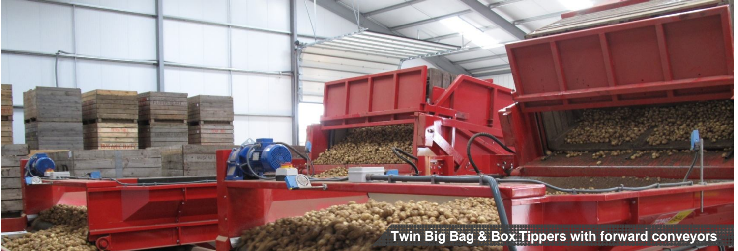
Twin Big Bag & Box Tippers with forward conveyors