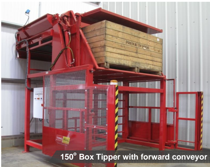
150° Box Tipper with forward conveyor