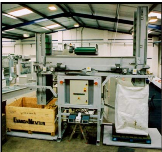
Twin VersaFill Big Bag/ Box Fillers