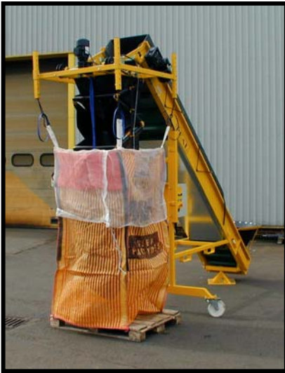
Single and Twin Cascade Big Bag Fillers