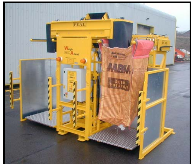
WeighAhead with weigh platforms