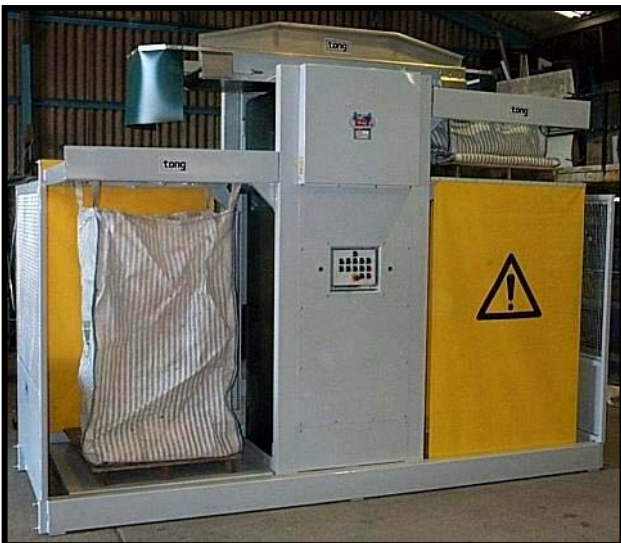
JetFill twin 'curtain' model